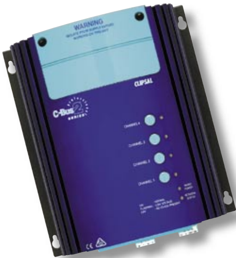
L5104D5 4 Channel Pro Series Dimmer.