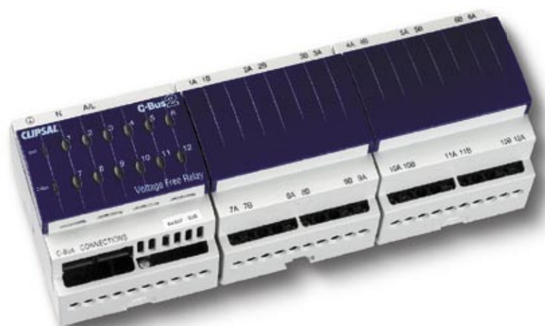
L5512RVFP 12 Channel Relay.