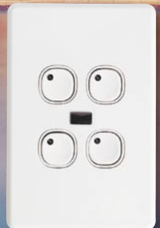
SC5034NIRL 4 Gang IR Switch.