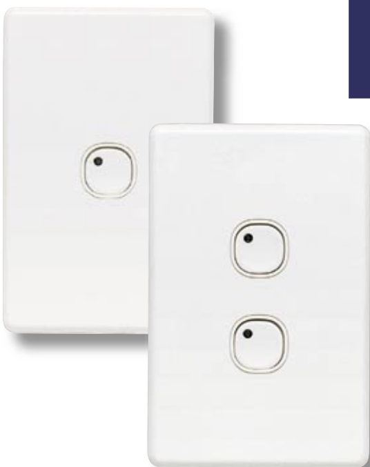
SC5031NL and SC5034NL 1 and 2 Gang Switches.