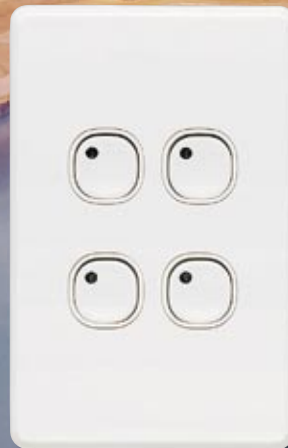
SC5034NL 4 Gang Switch.