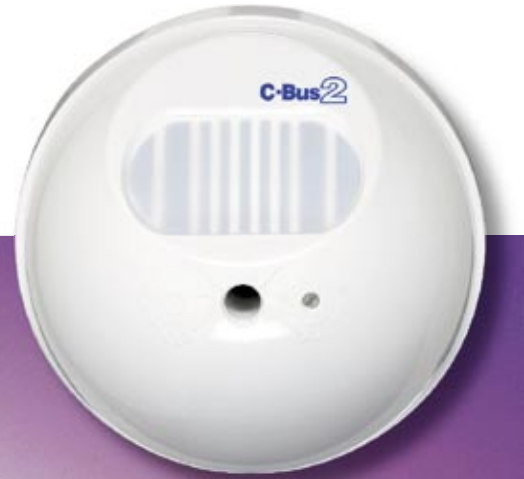
5751L Internal Infrascan.