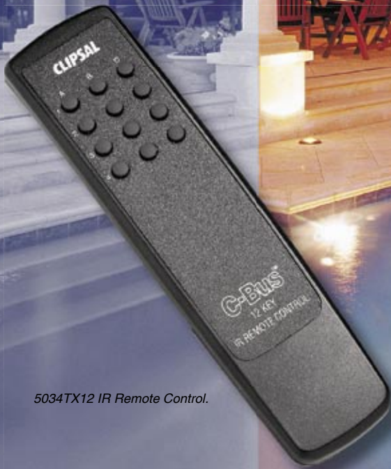
5034TX12 IR Remote Control.