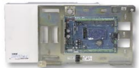
5200CU/2 Clipsal HomeMinder Central Controller installed in the home. The unit is supplied with cables and power transformer.

In the Home Theatre, an infrared C-Bus switch controls a combination of halogen downlights and neon tube lights. A touch screen home theatre remote control enables the owners to select from a variety of lighting scenes including Movie Time, Intermission and a simple All On or All Off.